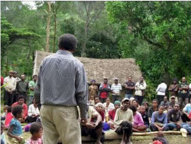
Local Village Welcome and Opening Ceremony for the first School in the Village