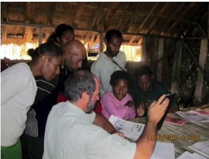
Teacher Training Minj

We thank the Lord for the progress thus far, however, this project is still in the infant stage. We are grateful for all your prayers and support thus far and would ask for your continued support and prayers.