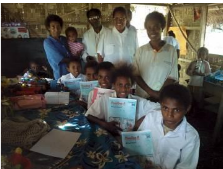
Students at Karkar Island