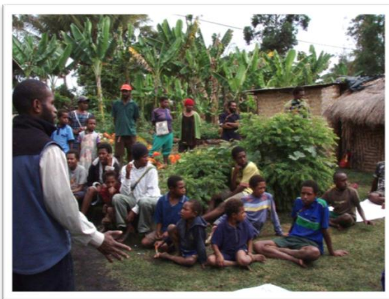
Goroka Seminar practical training attendees