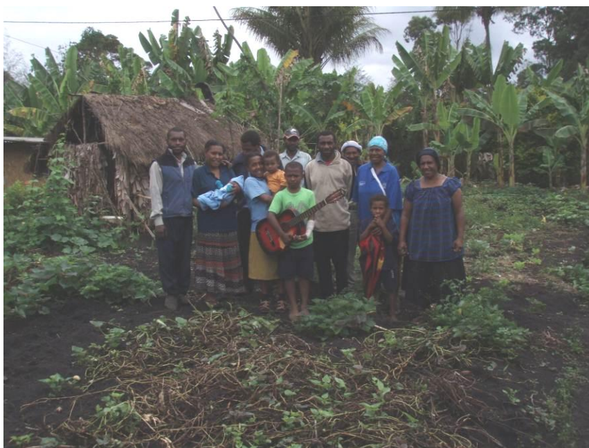
Members and interests standing on ground dedicated to a church will be erected in Goroka Town

It has been several years since a visitor to Perth's Guildford Church returned to Goroka, a large town in Eastern Highlands Province of Papua New Guinea. Ever since that time, thought has been given to the work in Goroka where the main produce grown are pineapples, bananas, coffee plantations and sweet potatoes. Some corn is also grown as the main cash crop for subsistence farming. Along with the nice climate this town is also a university town where many students come to study.