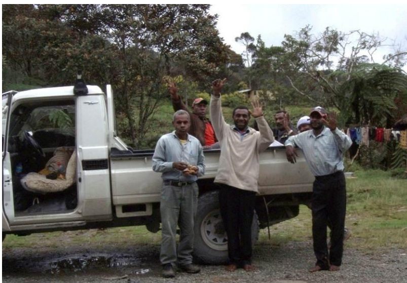
Stopping for breakfast bananas and picking up a traveller at roadside

In Papua New Guinea two Agriculture Seminars were delivered in two locations. The distance of separation between them was only about 140 kilometres; however it took more than 5 hours to drive that distance due mainly to poor road conditions. All who drove it wished that we could have travelled by helicopter instead. Some of the so called “potholes” really were called “mumu holes” which our vehicle’s 4wd tyres sank quite well into, creating a big jarring bump. The larger highway holes were big enough to take the entire vehicle we were given the use of to drive to these two locations. Having such a slow speed of travel meant the vehicle overheated several times and we had to stop to cool it down. Driving speed never exceeded second gear for that reason. The brethren who accompanied us were very grateful for the mandatory cooling down time. On the way to Goroka we stopped at the top of the mountain pass called Daulo Pass and picked up a man who asked many questions and took a Sabbath Bible Lesson pamphlet with