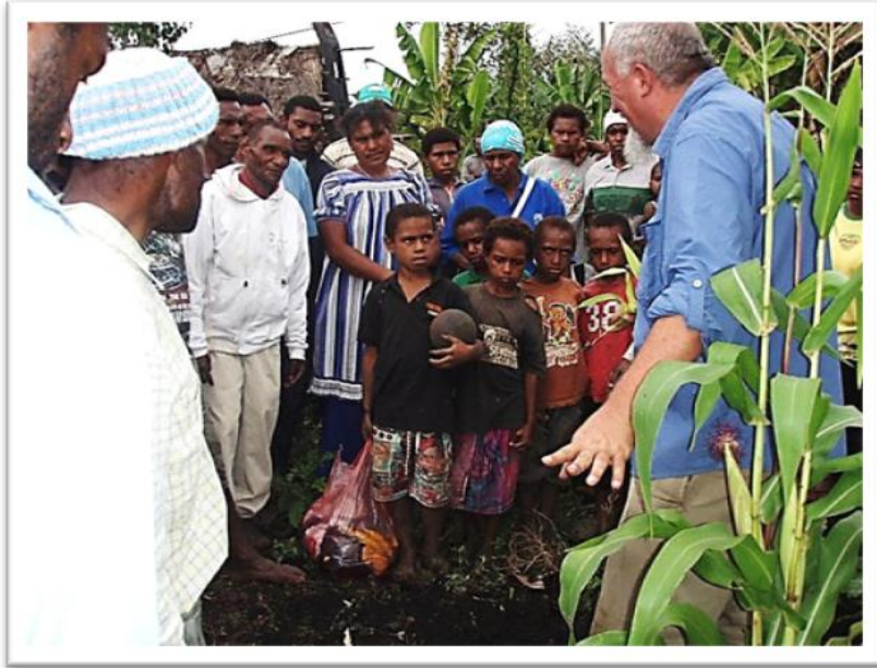
Goroka Practical training on improving sweet corn production methods

For the past two years several outreach seminars were planned by the Welfare Department to take place in the various islands of Oceania. Due to various funding issues and time constraints the department was unable to complete the scheduled events until just now. As we write this report to you, several more events are in progress. One of the most recent events was a one day Agriculture and Garden Improvement Seminar held in Western Samoa. The members and visitors in attendance really appreciated the information given on soil biology to help them with their garden soils. In addition seed saving and seedling cultivation lessons were given with hands on instruction on how to make natural pest and fungal remedies.