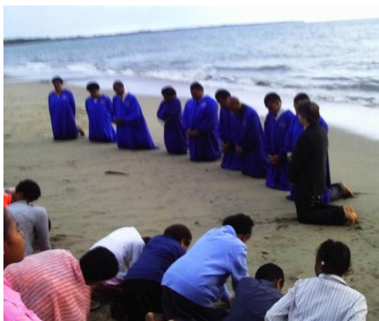
Baptism in Fiji, October 2012