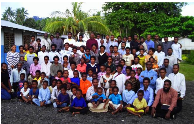
Youth Convention in Papua New Guinea, January 2013