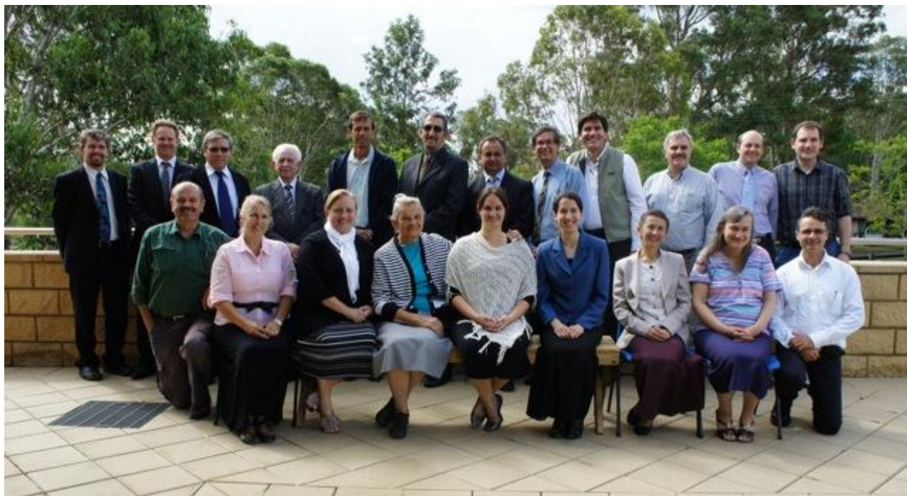
Delegates at the NSW Conference Delegation Session - two had already left

On Sunday, 3 rd February 2013, 22 delegates of the NSW Conference of SDA Reform Movement gathered to elect new officers for the next two years. We praise God that each committee was able to work harmoniously together and organise the various departments to continue promoting the work of soul-saving throughout the state of New South Wales