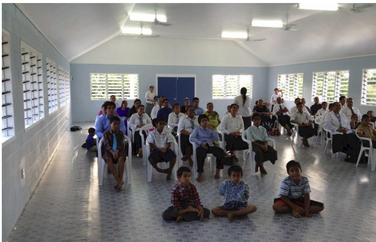
SDARM Samoa Mission Field, Church Dedication Service, September 2013.