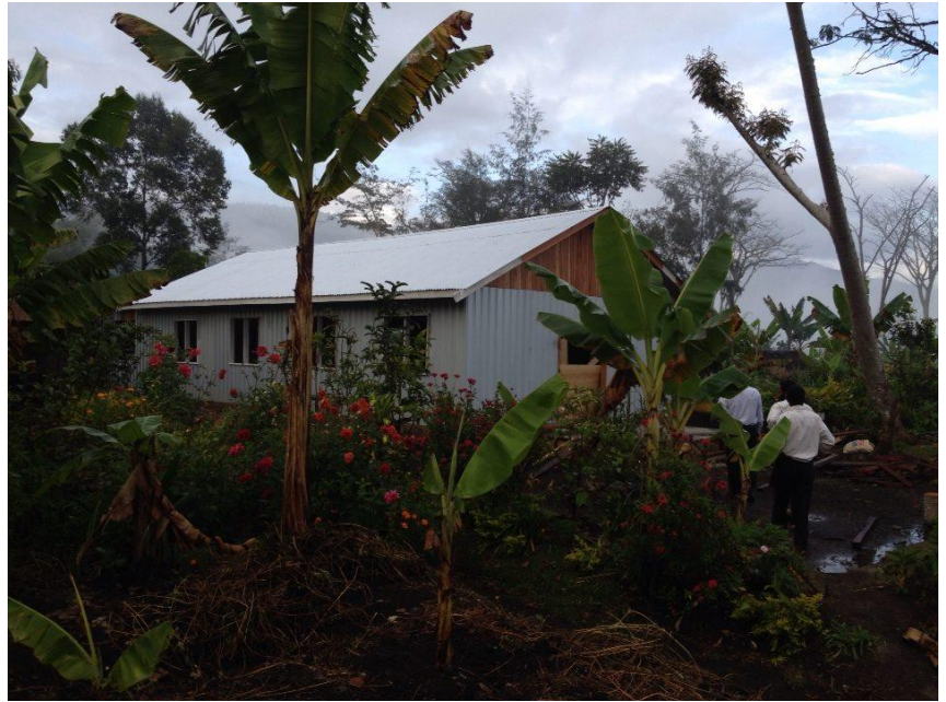
Photo 1 Newly Erected Chapel in Minj